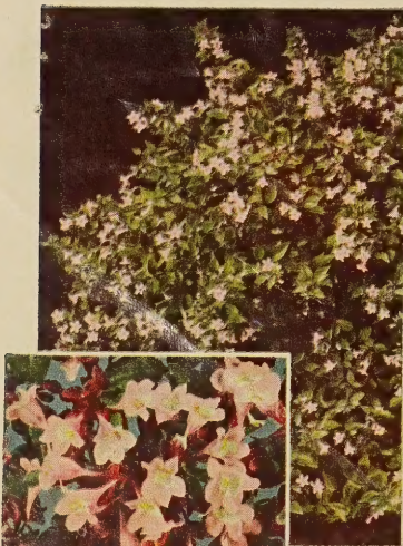
All Summer Flowering Abelia